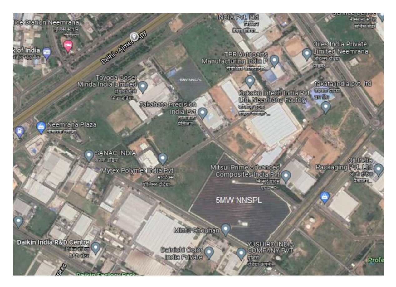
LOCATION MAP OF 5 MW SOLAR PLANT OF NNSPL

The above showing satellite image of location and below showing the Google map location of the NNSPL 5MW Solar Plant at Neemrana